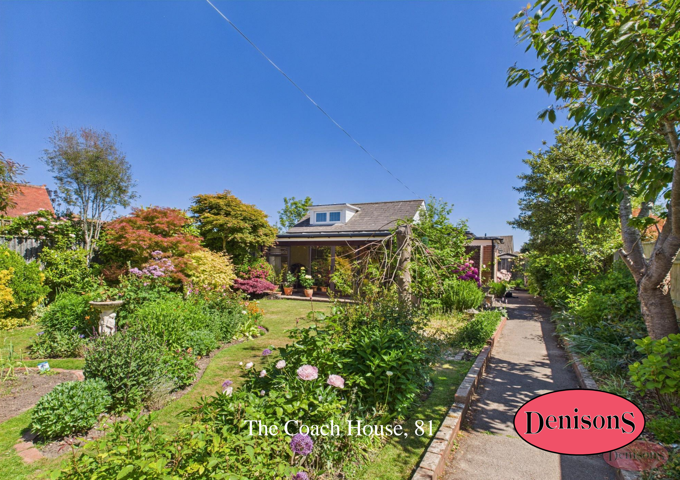
The Coach House, 81